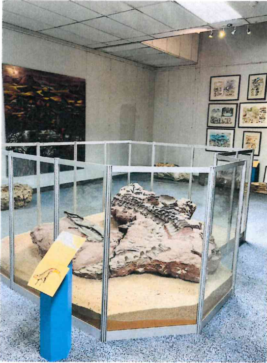
Fig. 3: Sensitive Display Cabinets