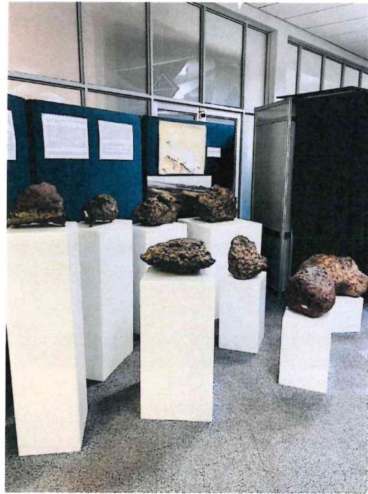
Fig. 4: Meteorites moulded on Marbles