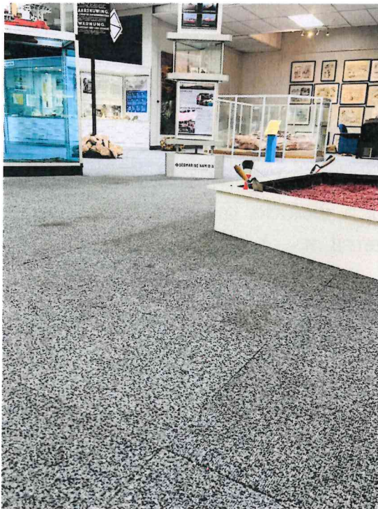
Fig. 1: Old Carpet