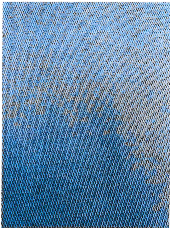
Fig. 2: New Dark Blue Carpet